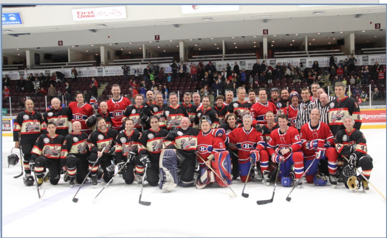
The Peterborough Quacks and Montréal Canadiens Alumni post-game at the Peterborough Memorial Centre.