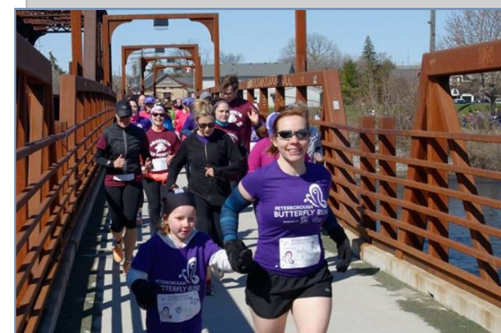
Runners were able to personalize their bibs with names of their loved ones they were honouring.